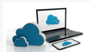
Real time access via cloud