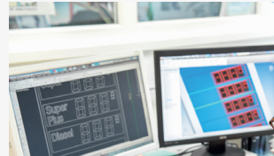
Construction & Design