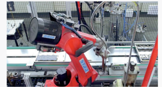
Robot applying IP67 coating